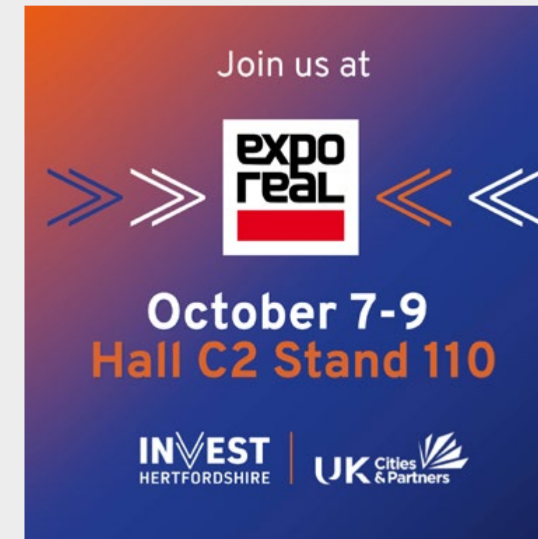
Join us card